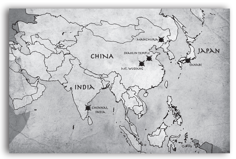
Key sites from Chapter One: Chennai (India), Mount Wudang, the Shaolin Temple, and Manchuria (China), and Tanabe (Japan).

Similarly, they have been categorized this way due to the key aspects of their legends historically, and the relevance they hold in the modern world. In this respect, we know each of the three figures for their contributions to the religious and spiritual sides of martial arts as much as for their physical contributions.