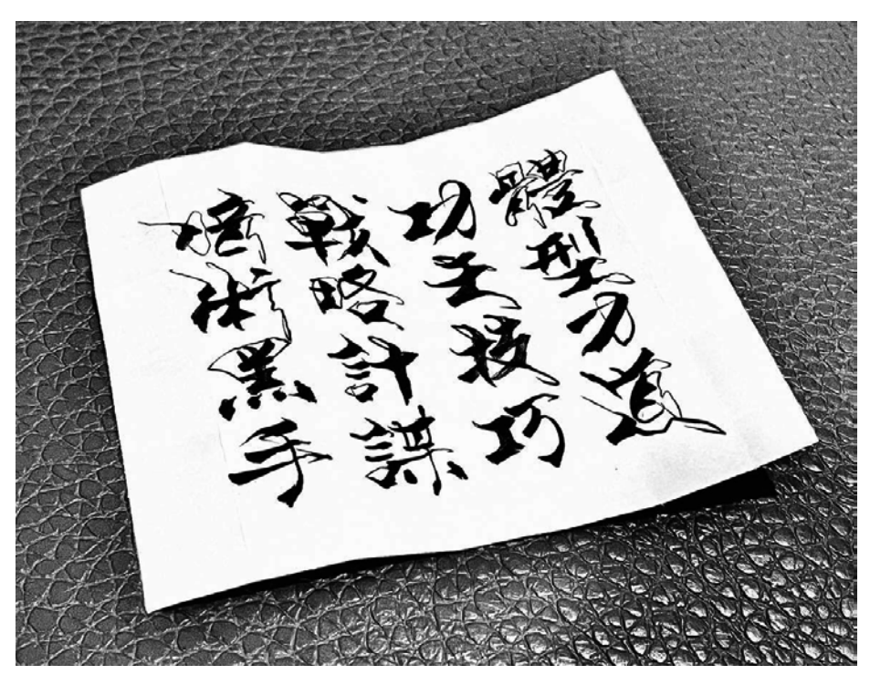
Physical Strength ~ Gongfu Skills ~ Strategies and Tricks ~ Dark Arts and Dirty Tricks.

Opportunity seeking people and people looking for opportunities. Equally unpredictable, elusive.